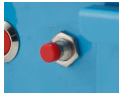
Indicator check valve