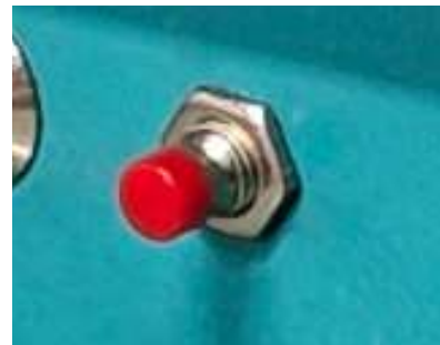
Indicator check valve

Web: https://www.dmejde.com E-mail: info@dmejde.com